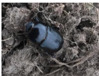
Adult Black Beetle

http://www.gippsdairy.com.au/LinkClick.aspx?fileticket=PniOANU7Mig%3D&tabid=39