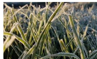
Frosted Pasture early on a Saturday morning

Ensure pastures are sown early and well established in susceptible areas or look to use frost tolerant species.