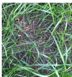
Damaged pasture from Black Beetle