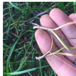
Nipped off pasture at the base